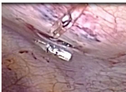
C: Illustration of port site closure with anchors and tied sutures