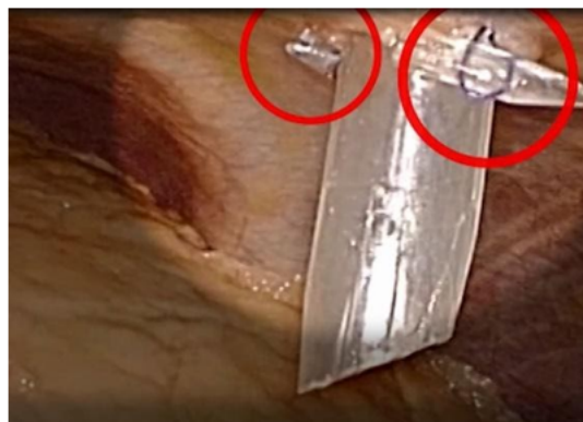
A: TroClose1200 cannula and anchors in-situ in the abdominal wall, after deployment and removal of the obturator