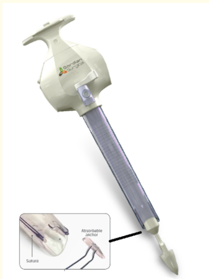
Figure 1: The TroClose1200 system (obturator assembled in the cannula). Left: the TroClose cannula's distal end with pre-loaded anchors and threads; Right: one anchor with its thread.

The TroClose1200 enables surgeons to use the device as a regular trocar as well as a closure system (Figure 1). After trocar insertion, the surgeon deploys two absorbable anchors that are attached to absorbable sutures (Figure 2). When the cannula is removed, the fascia was closed by simply tying the TroClose1200 sutures (Figure 2) which enables efficient closure of the port site.